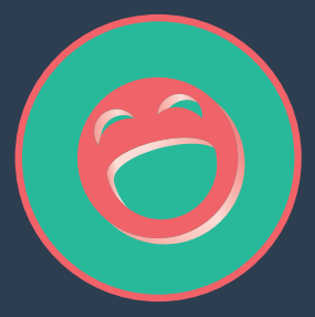
QUALITY OF LIFE